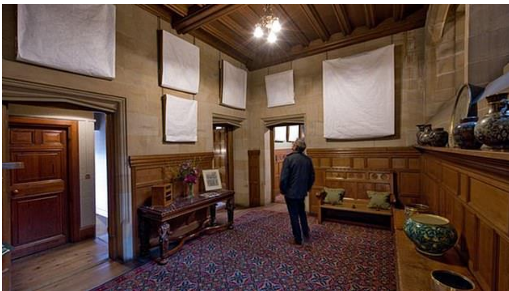
Art works at the Victorian country house in Northumberland (pictured), which belonged to Baron Armstrong, were covered up as part of the National Trust's 'Women in Power' exhibition