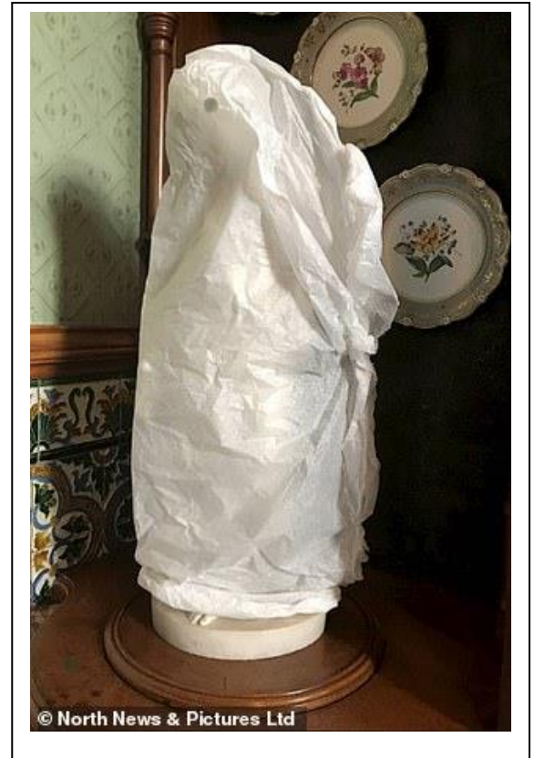
A statue on the upstairs floor at Cragside covered in a plastic sheet (right) was just one of a number of art works covered up (left)